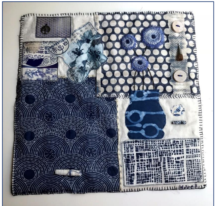
Feeling the Blues Created by Linda Sweek

In this workshop , we will begin by looking at a variety of collages to become inspired on ways to layer and enhance collage work. Then we will begin to create two collages – the first will be a predetermined collage in a kit form that I will provide. The second collage will be your own design .