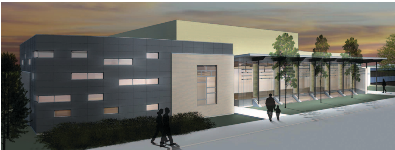
Artist's rendering of the Fine Arts facilities and student center.

Offensive Lineman at the University of Wisconsin-Madison, 2008-12