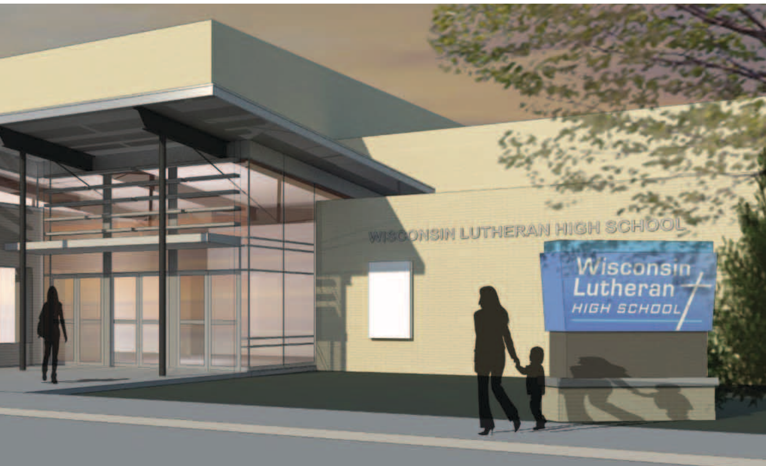
Artist's rendering of new entrance, student center and Fine Arts facilities.

“ No Lutheran school would be complete without a high quality fine arts program. It is especially through music that the Word of God can become personally meaningful for the Christian. Music and art enhance worship, engage the hearts and minds of those who worship, and provide a splendid means of expressing personal faith and emotions.